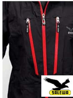
Salewa Kali GTX M JKT jacket (GER)