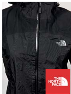
The North Face W Impervious Jacket jacket (US)