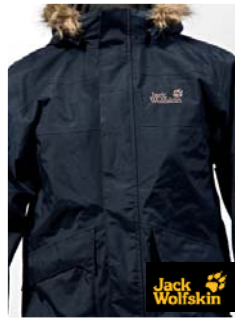
Jack Wolfskin Nebraska Parka jacket (GER)