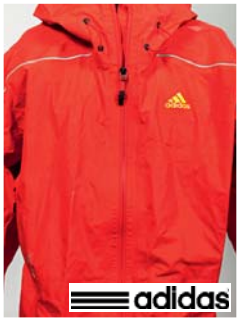
Adidas TX GTX ActS j jacket (GER)