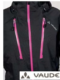
Vaude Cheilon Stretch Jacket 2 jacket (GER)