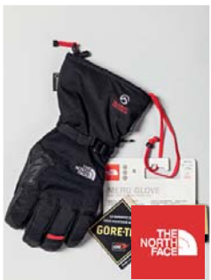
The North Face Meru Glove gloves (US)