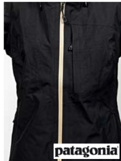
Patagonia W'S Powder Bowl JKT jacket (US)