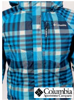
Columbia Evo Fly Jacket children's jacket (GER)