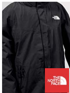
The North Face All Terrain II jacket (GER)