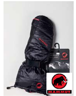
Mammut Extreme Arctic Mitten gloves (CH)