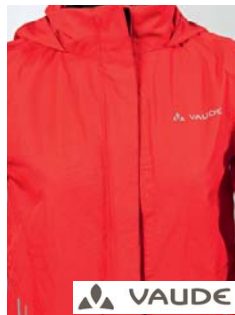
Vaude Kids Rain Jacket children's jacket (GER)