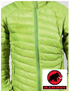
Mammut Miva Light Jacket Women, jacket (CH)