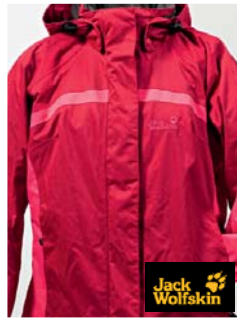
Jack Wolfskin Topaz Jacket Women jacket (China)