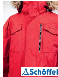
Schöffel Keaton jacket (GER)