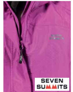
Seven Summits Monte Viso jacket (A)