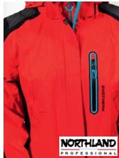
Northland EXO Pro STR Monie JKT jacket (A)